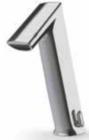
GH Total height: 252 mm Spout height: 162 mm