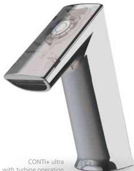
CONTI+ ultra with turbine operation