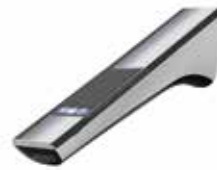
Wall with solar Spout length: 240 mm Spout height: any