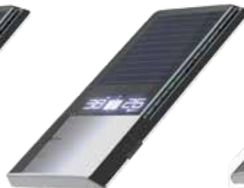
Expert Solar Solar cells together with display of water temperature and water running time.