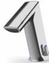
GM Total height: 178 mm Spout height: 94 mm