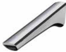
Wall without solar Spout length: 240 mm Spout height: any

The CONTI+ ultra wall model, with its high quality design, is suitable for use in hygienically critical environments or where installation on a washbasin is not desirable.