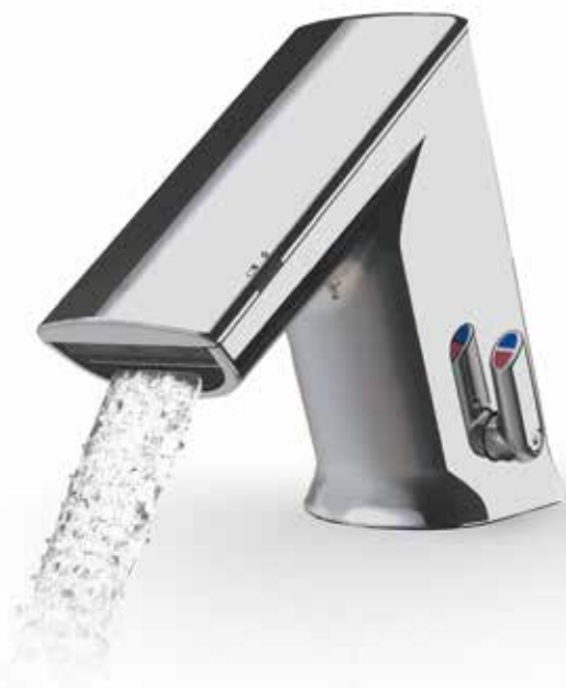
CONTI+ ultra GS: Short faucet – with a high level of functionality and innovation

A complete service can only be undertaken above the washbasin. Operating states, such as 'battery low', can be easily identified by the LEDs on the side.