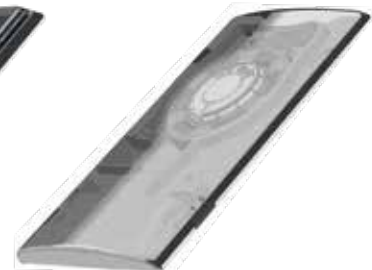
Turbine Energy from turbine extends the battery life to up to eight years.