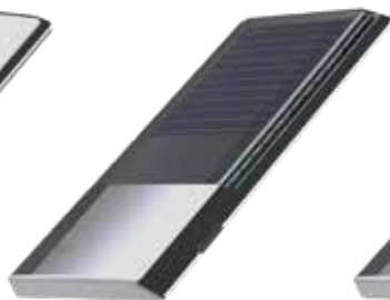
Public Solar Energy from solar cells extends the battery life to up to eight years.