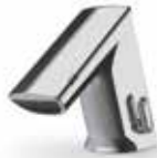
GS Total height: 123 mm Spout height: 51 mm

CONTI+ ultra is available in three sizes with or without temperature control and drain assembly. Each model is ready for data exchange via cable or wireless connection.