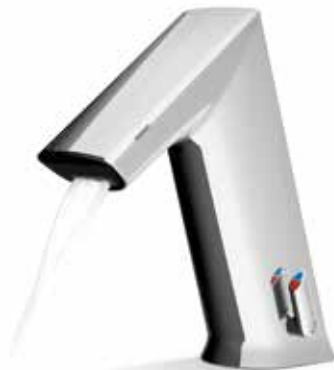
5.7 l/min jet aerator