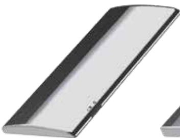
Public The definitive model for use in public areas. A clear, well rounded electronic module.

Stylish technology offering a variety of modules and superior energy options. All types of sanitary facilities are catered for with four energy options: mains, battery, solar and turbine operation.