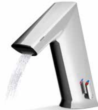
1.9 l/min spray aerator

Individual aerators: flow rates of 5.7 l/min down to a water saving 1.9 l/min with three different spray patterns – suitable for all applications.