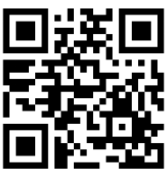
CONTI+ ultra online