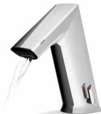
5.7 l/min laminar aerator