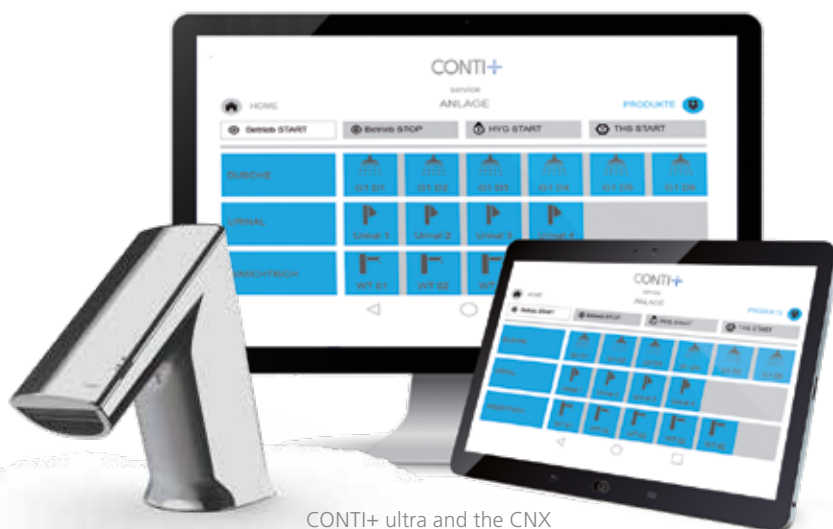
CONTI+ ultra and the CNX Water management system – Systematic approach with CONTI+

The intuitive CNX water management system from CONTI+ has been created to meet the most demanding hygiene requirements. The user friendly interval or calendar functions present an easy way to automate and efficiently document essential flushing.